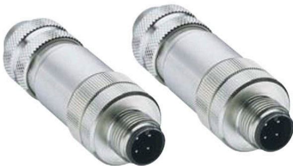
Part no.: 426128 AC-MLC-END Connector set